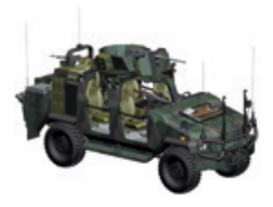
Special Forces Vehicle