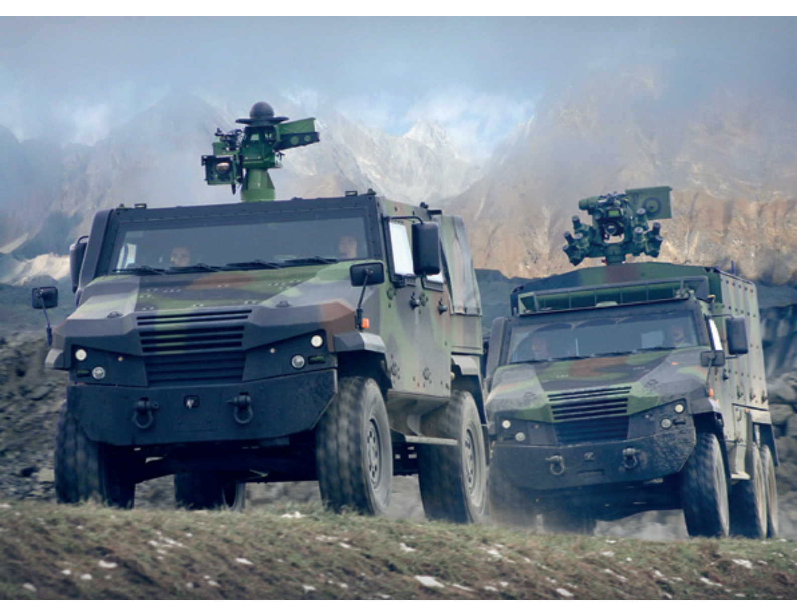
Family of Wheeled Light Tactical Vehicles