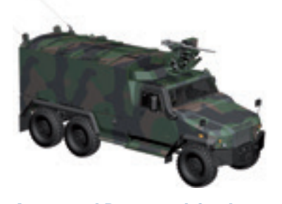
Armoured Personnel Carrier