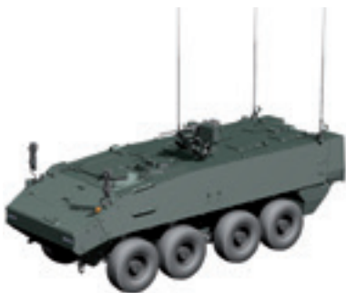
Armoured Personnel Carrier APC