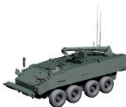
Maintenance, Recovery Vehicle MRV