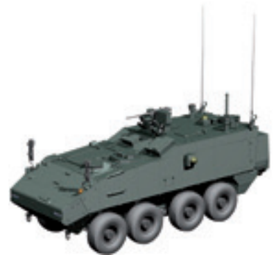
NBC Reconnaissance Vehicle NBC