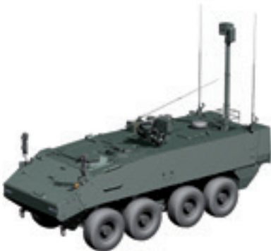
Command, Control & Communication C3