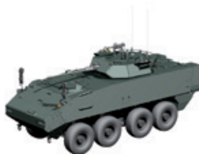
Infantry Fighting Vehicle IFV