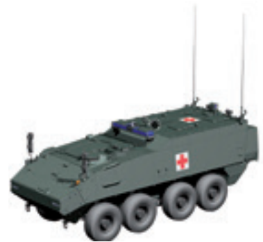
Ambulance Vehicle AMB